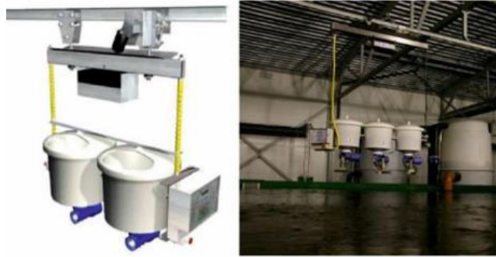
Figure 3: Rails feeders for aquaculture farms (Fish Farm Feeder, 2022)

Figure 3 is the rails feeders which are the third type of fish feeders for aquaculture farms. This type of feeders has silos and dispensers that circulate on a rail previously installed over the tanks at a fish farm. The advantage for these feeders is it contributes to labour savings. It has centralized software for feeder and feeding management, (Fish Farm Feeder, 2022).