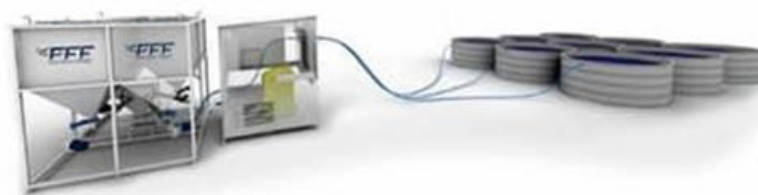
Figure 5: Central feeders (Fish Farm Feeder, 2022)

Figure 4 shows the drag chain feeding system. These feeding systems work through pipes with a drag system. The advantage for this feeding system is it has a single feeding line for transporting feed, (Fish Farm Feeder, 2022).