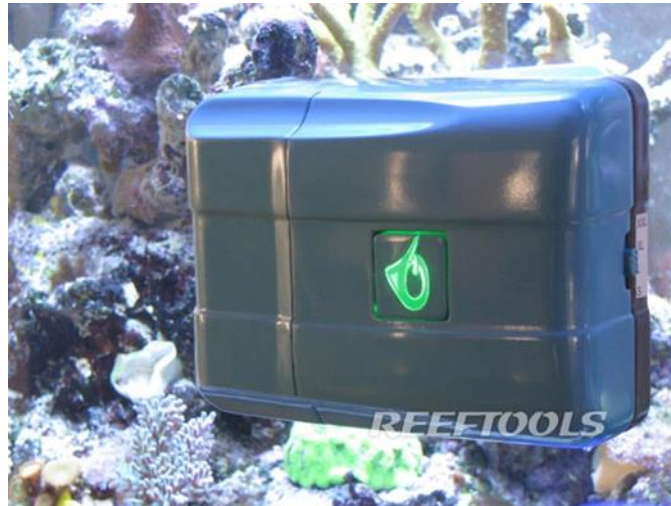
Figure 7: RoboSnail an aquarium Roombas is a small robot that functions as a vacuum (Fpsbackuptest, 2012) .

The fish tank and net cleaning robot refers to an innovative solution that automates aquarium maintenance and the cleaning of important tools such as fishing nets. In the case of fish tanks, robotic devices are designed to perform tasks such as removing algae, cleaning glass or acrylic surfaces, vacuuming debris from substrates, and even monitoring and maintaining water quality. These robots, which can include magnetic algae scrubbers, automatic gravel vacuums, or more advanced underwater cleaning robots, significantly reduce the time and effort required for manual cleaning. They ensure a consistent level of cleanliness, which is important for the health of the aquatic environment and the well-being of the fish and plants in the tank (Fpsbackuptest, 2012).