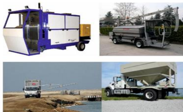
Figure 2: Moving feeders for fish farming (Fish Farm Feeder, 2022)

There are six types of fish feeders. The first type of fish feeders as shown in figure 1 is the single fish feeder for aquaculture. Single fish feeders are individual feeders that are connected to a control panel. The advantage for single fish feeders is low-cost investment. They allow continuous dosing, (Fish Farm Feeder, 2022).