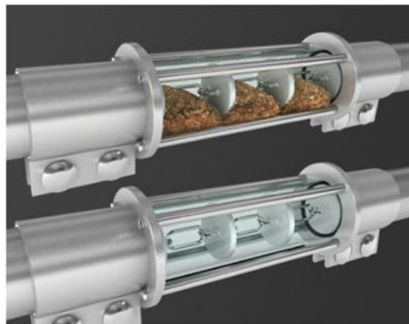
Figure 4: Drag chain feeding system (Fish Farm Feeder, 2022)

Figure 3 is the rails feeders which are the third type of fish feeders for aquaculture farms. This type of feeders has silos and dispensers that circulate on a rail previously installed over the tanks at a fish farm. The advantage for these feeders is it contributes to labour savings. It has centralized software for feeder and feeding management, (Fish Farm Feeder, 2022).