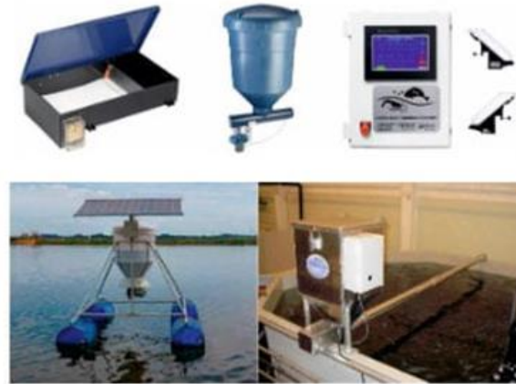
Figure 1: Single fish feeders (Fish Farm Feeder, 2022)

There are six types of fish feeders. The first type of fish feeders as shown in figure 1 is the single fish feeder for aquaculture. Single fish feeders are individual feeders that are connected to a control panel. The advantage for single fish feeders is low-cost investment. They allow continuous dosing, (Fish Farm Feeder, 2022).