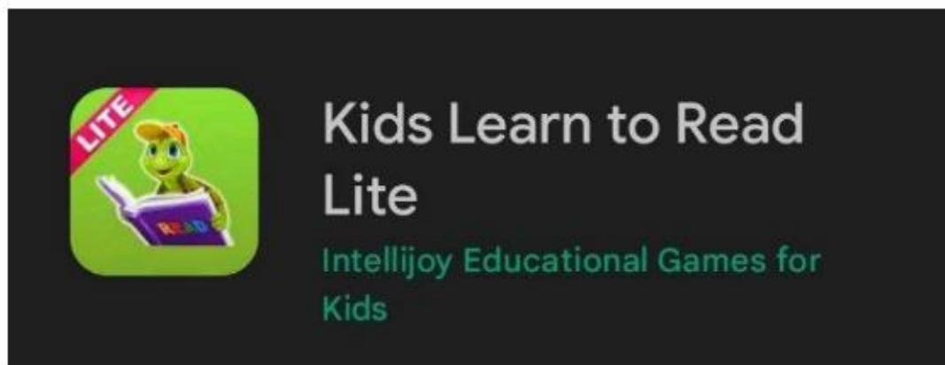
Figure 1.1 Kids Learn to Read Lite Mobile Application

Kids Learn to Read Lite, or Learn to Read with Tommy Turtle, is a fun game for preschool-aged children that encourages them to blend sounds into words, read and make simple words, identify spoken words, and learn word families. This mobile learning-toread application for children focuses more on letter sounds for early children's learning. It contains few sections. Unfortunately, some sections are only available in the full version, which requires users to subscribe before they can use them.